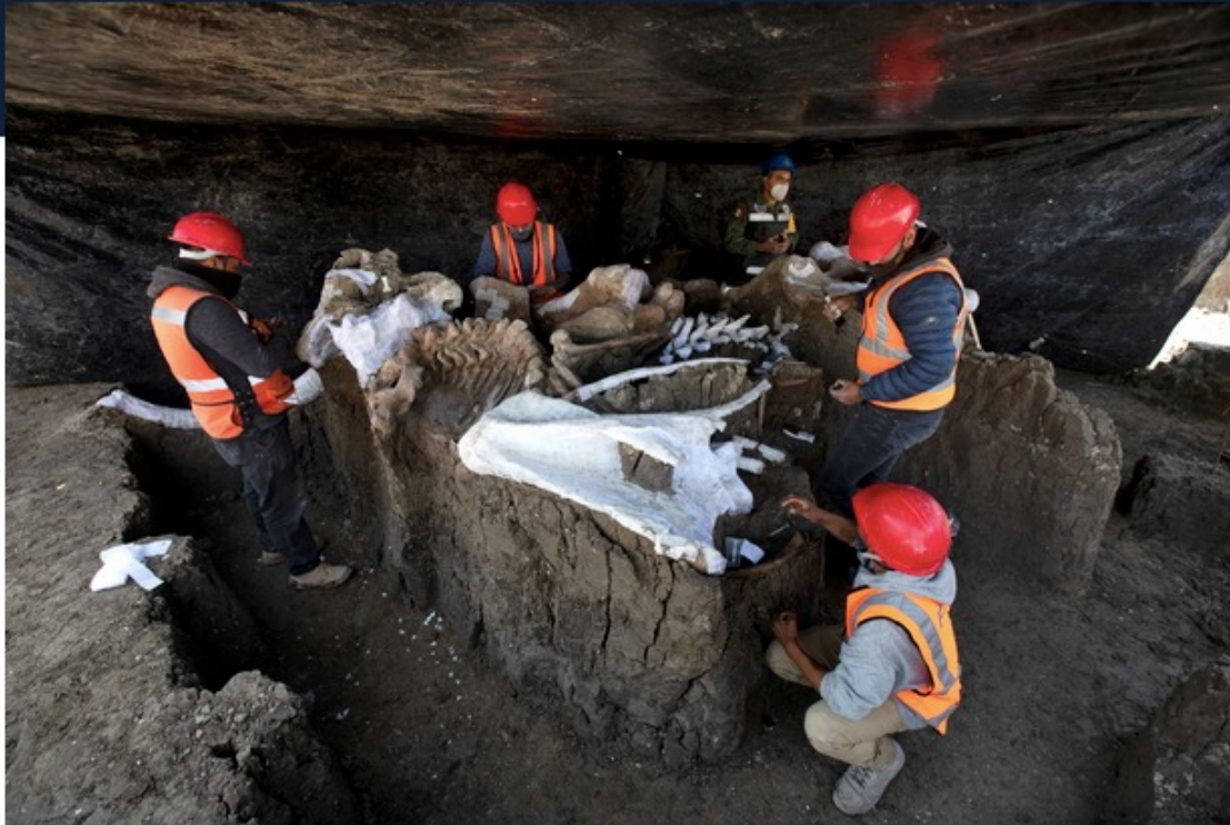
Paleontologists work to preserve the skeleton of a mammoth that was discovered at the construction site of Mexico City's new airport in the Santa Lucia military base, Mexico on Sept. 3, 2020.