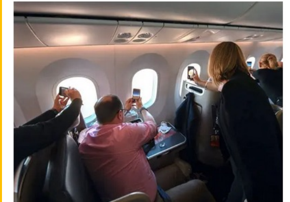
Passengers onboard a Qantas aerial tour over iconic Australian destinations.